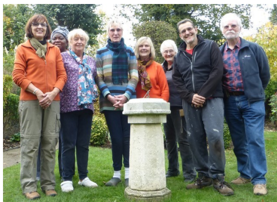
The 'Love Gardening' Crew