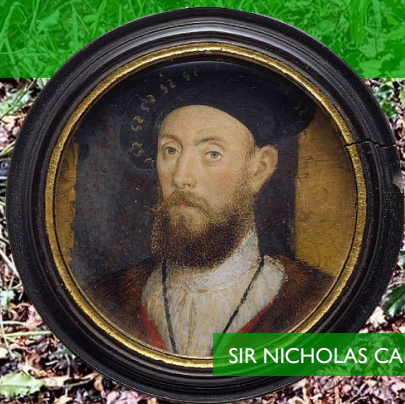
SIR NICHOLAS CAREW